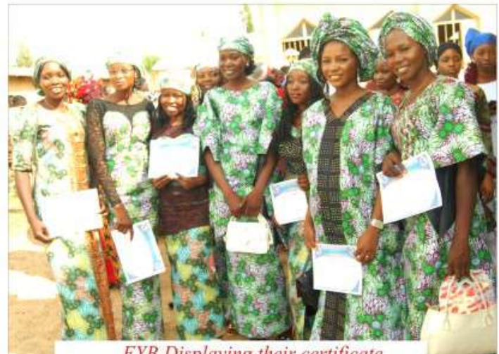
FYB Displaying their certificate

took his reading from the book of Psalms 136:10-26 with a topic; Grateful heart for a new beginning. He prayed for God's guidance and protections to the graduating students as they go out to the wider world. He also advises the FYBs to be strong, hardworking and keep pride aside after graduation and