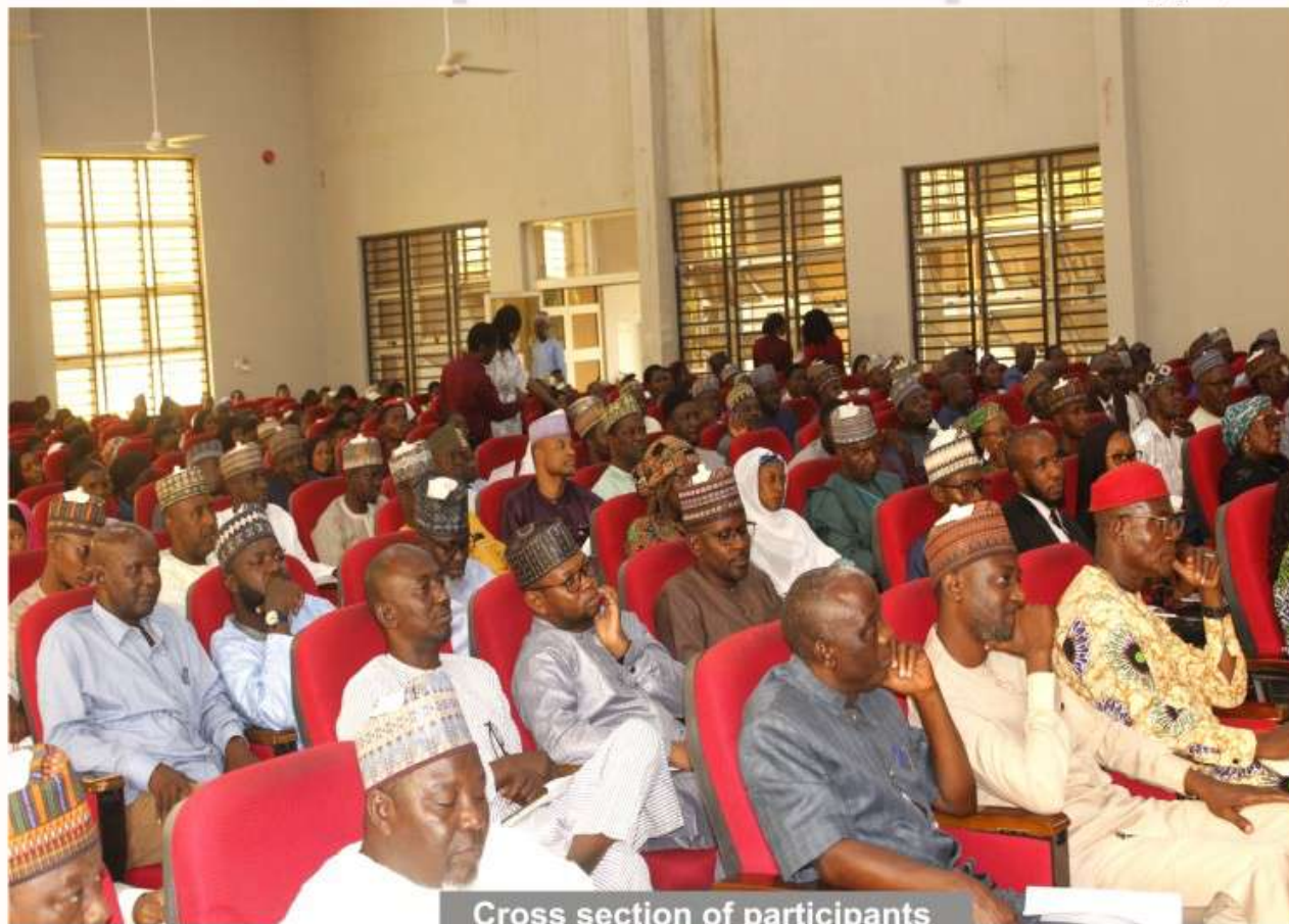
Cross section of participants

Prof. Pate however stated that UNESCO and other agencies reports indicated that huge number of journalists are harassed and killed every year, most of whom are