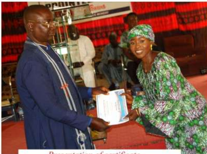
Presentation of certificate

practices which has become the order of the day. He also encouraged them to apply the knowledge acquired both in the classroom and the church as they go to the wider world that is full of challenges.