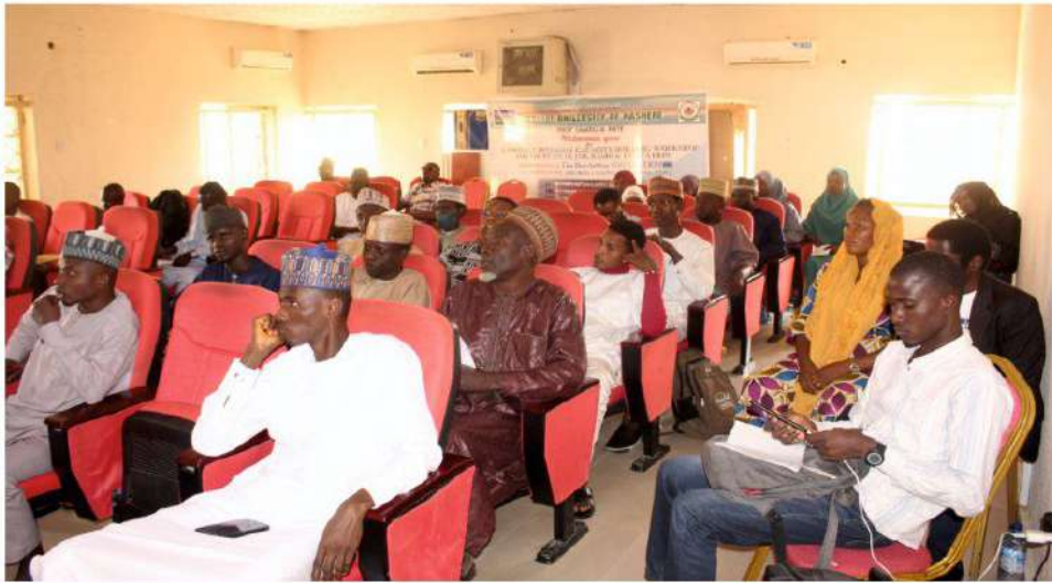
Cross Section of the participants

site where the guests were shown both complete, ongoing, and sites for intended projects. These included the completed PhD hostel, Medical College, additional class rooms, additional hostels, site for the new Senate building, among others.