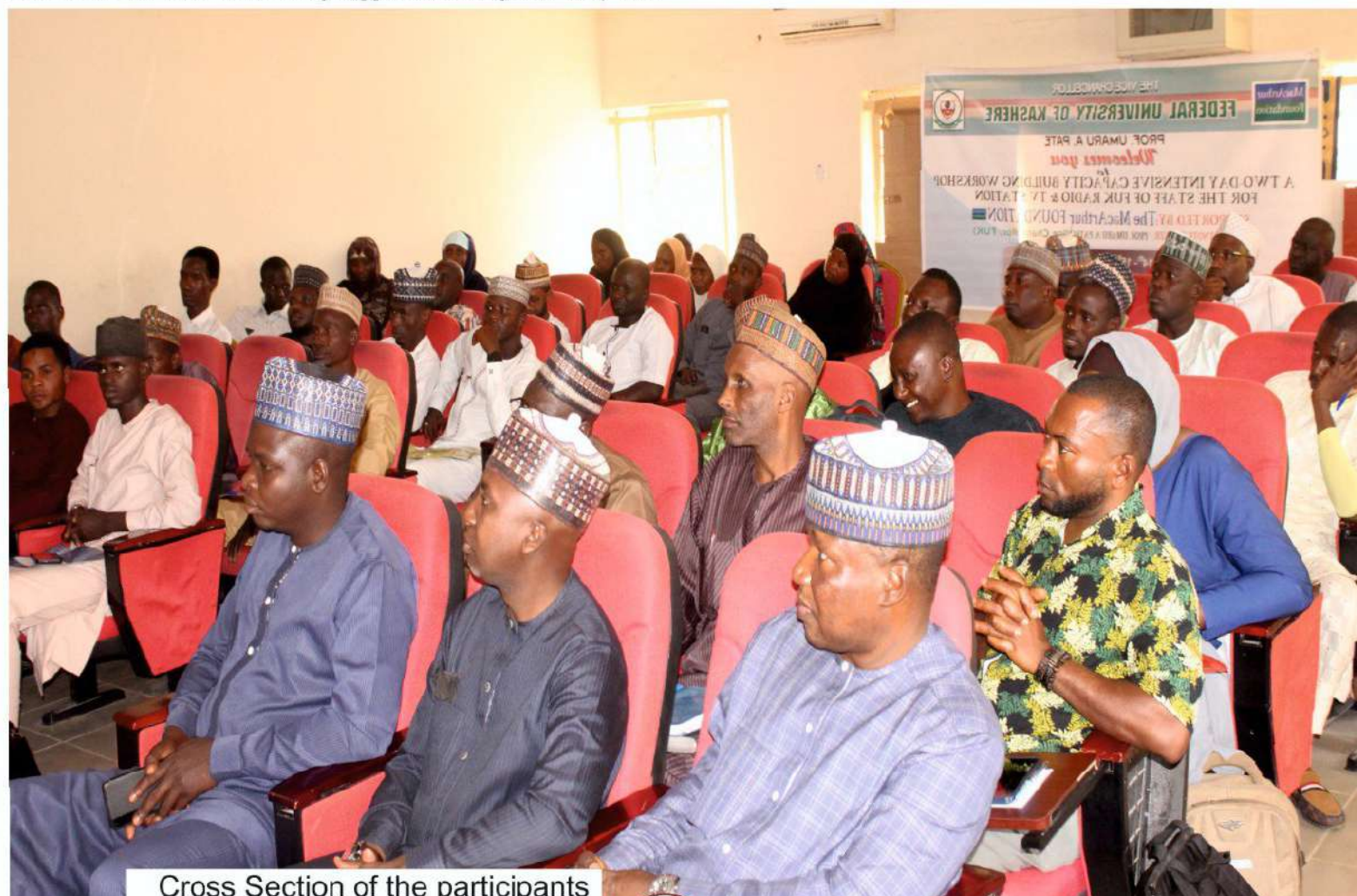
Cross Section of the participants