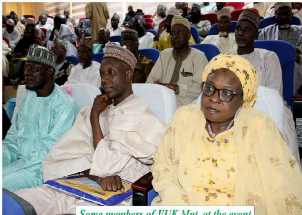
Some members of FUK Mgt. at the event