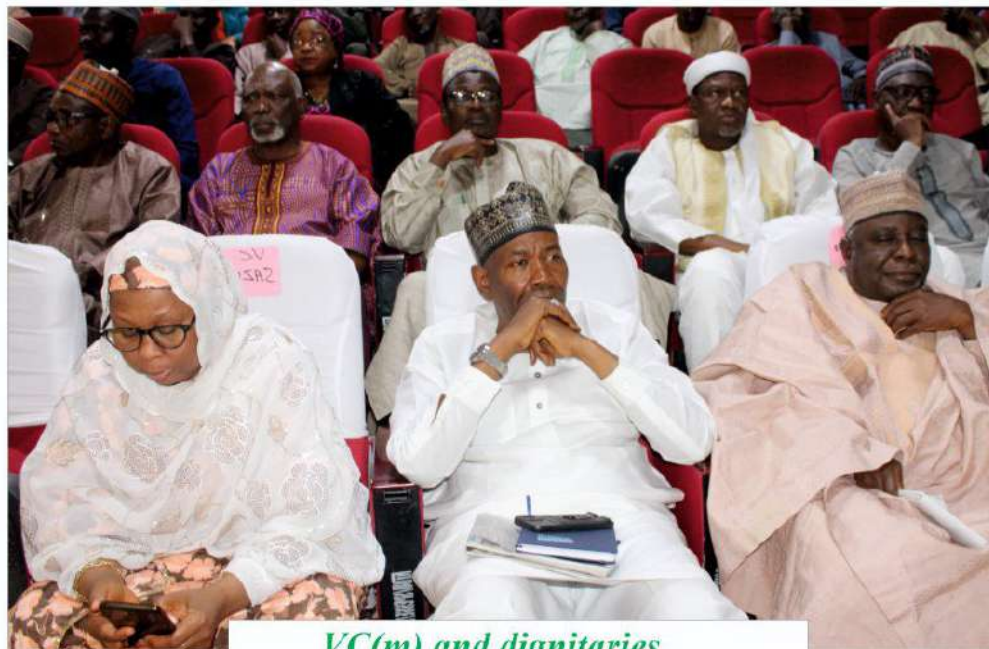
VC(m) and dignitaries

FUKashere News Bulletin recalled that the 4 Principal Officers of ATBU to include the