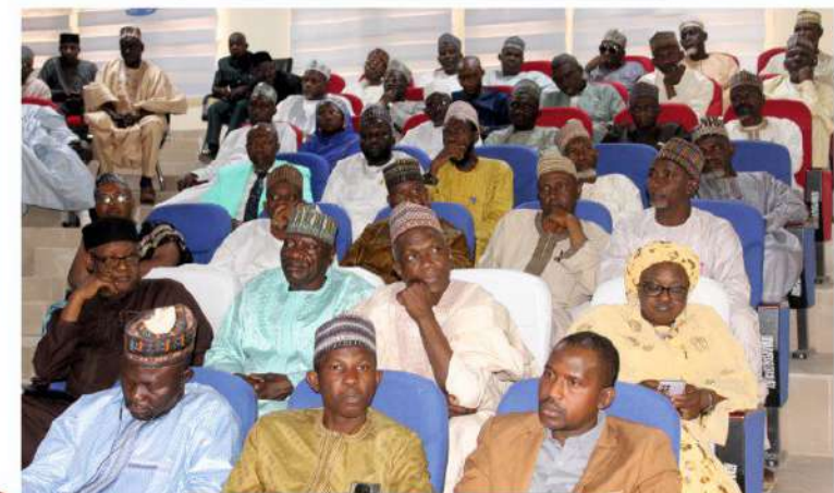
Cross section of participants