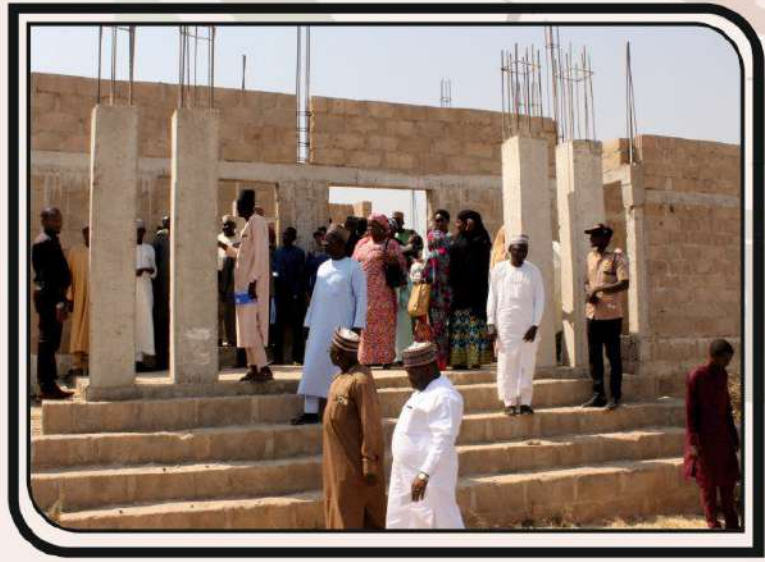
A tour at the university new site