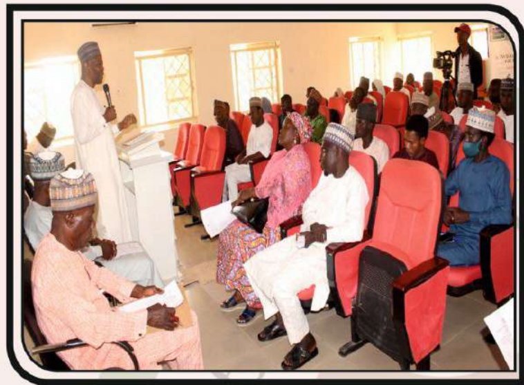
VC giving a keynote address