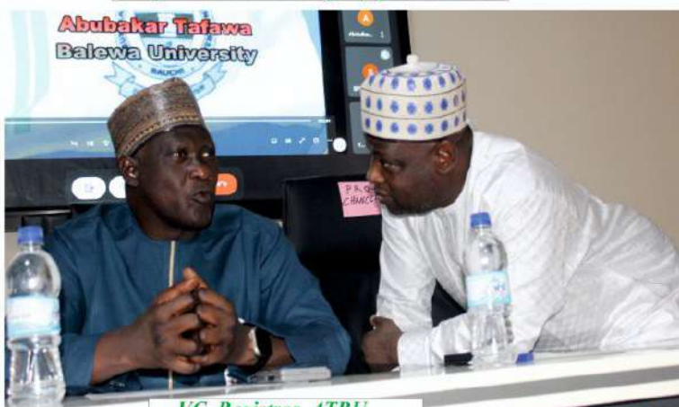
VC, Registrar ATBU