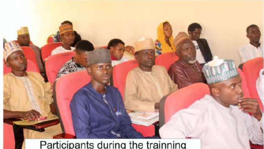
Participants during the training