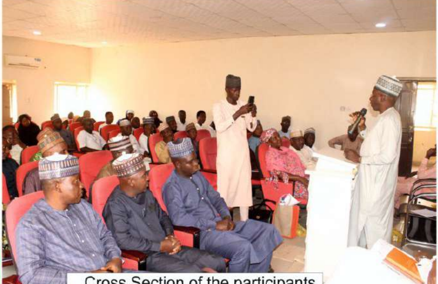
Cross Section of the participants