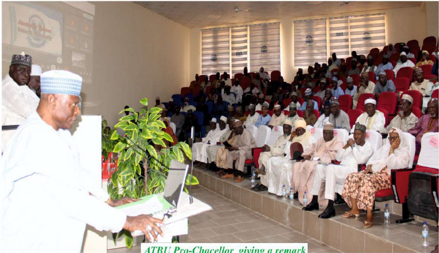
ATBU Pro-Chancellor giving a remark