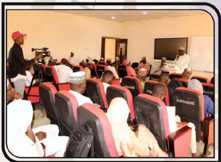
Station overseer giving a remark