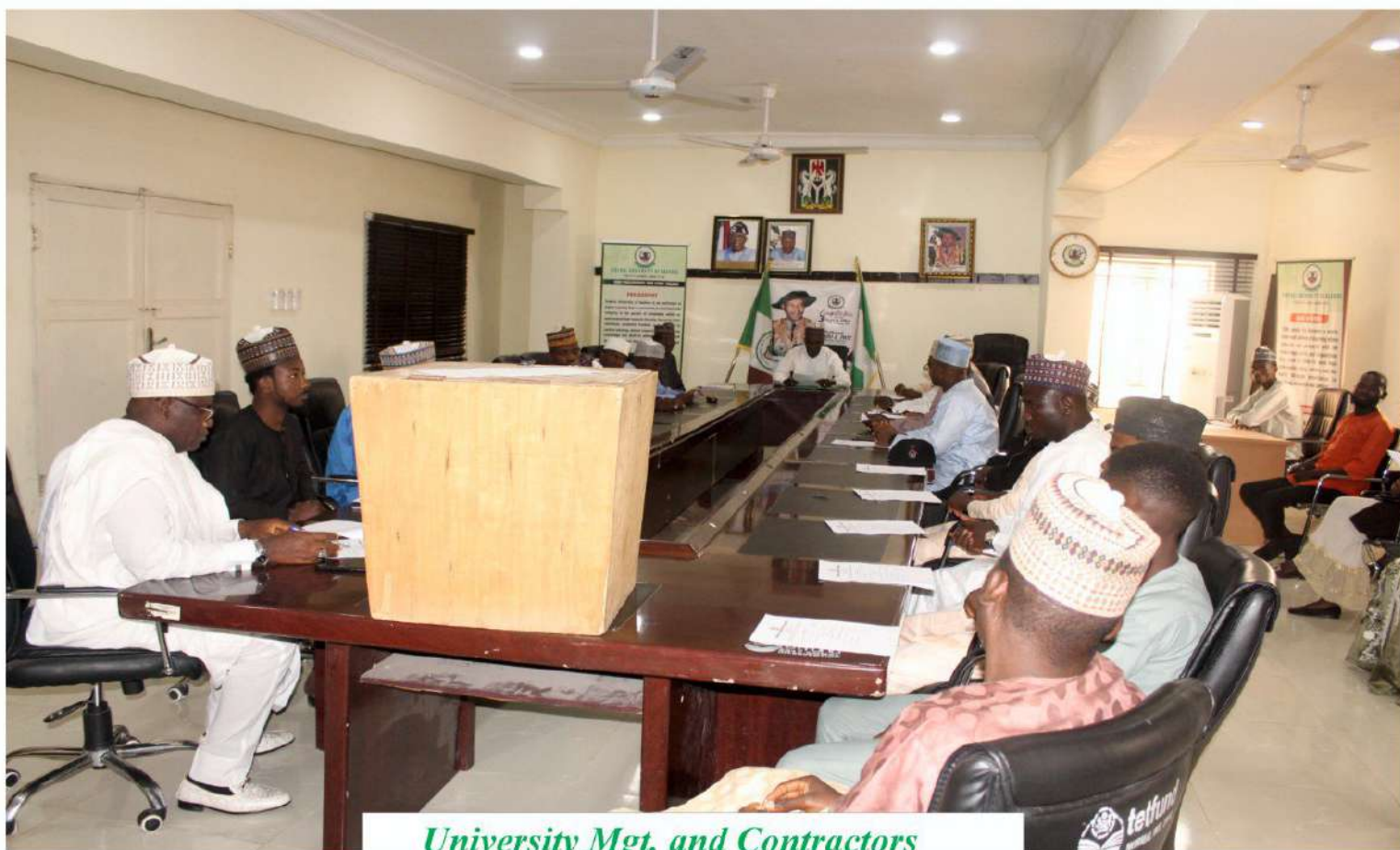
University Mgt. and Contractors

The exercise was witnessed by professional bodies, civil society Organizations and Students of the Department of Procurement Studies.