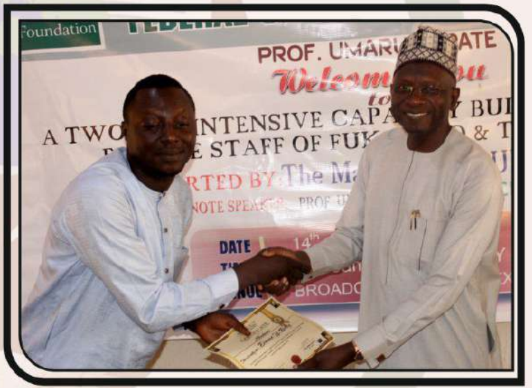
Presentation of certificates