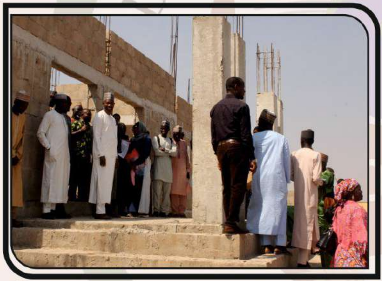
A tour at the university new site