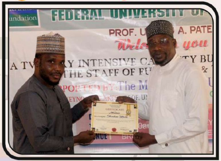
Presentation of certificates