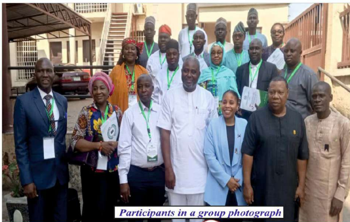
Participants in a group photograph

prepared to announce to the public important events, landmarks, clarify and or debunk rumours and negative publicity" .