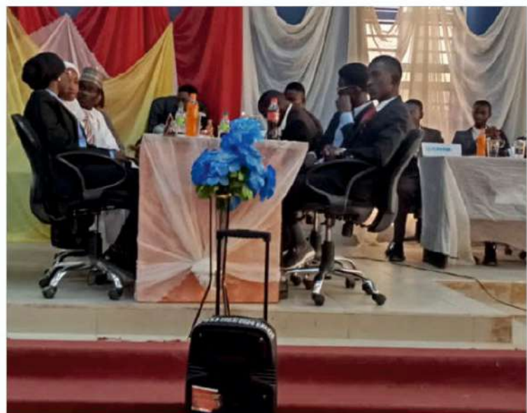
Cross section of participants