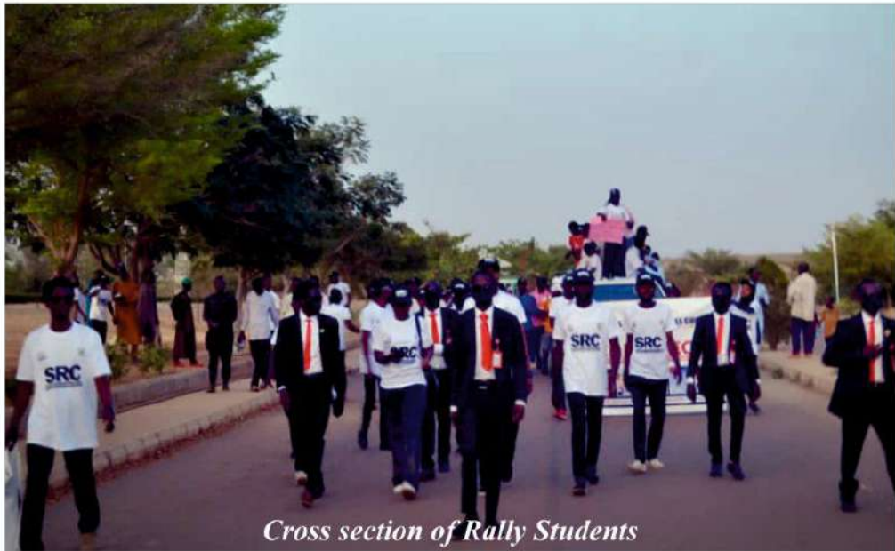
Cross section of Rally Students

"This rally is a great initiative. It shows that the SRC is working hard to tackle student concerns, and I believe it will help reduce social vices within our university," one student remarked.